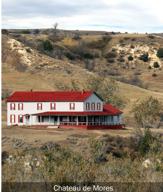
Chateau de Mores