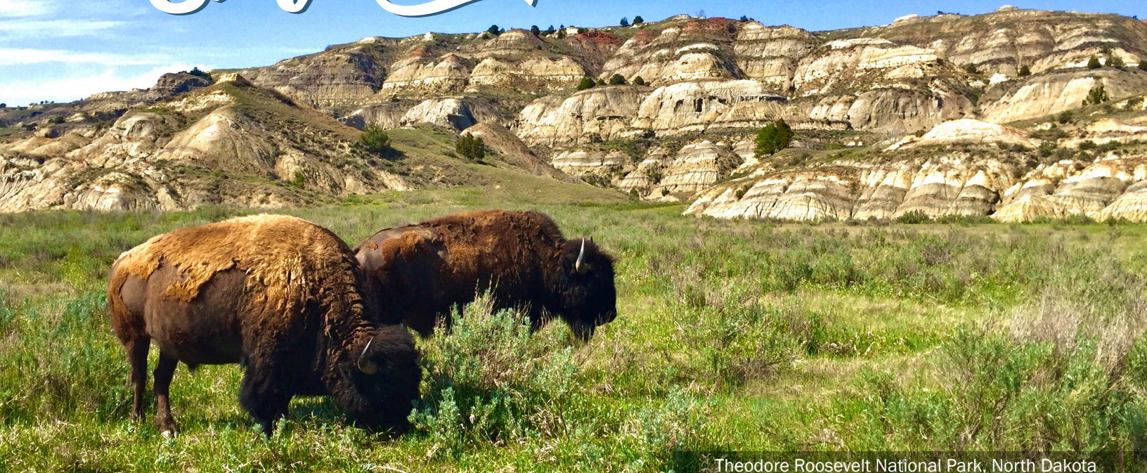
Theodore Roosevelt National Park, North Dakota