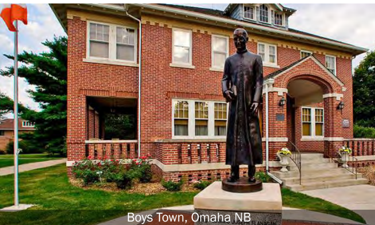
Boys Town, Omaha NB

To book, visit your professional travel agent: