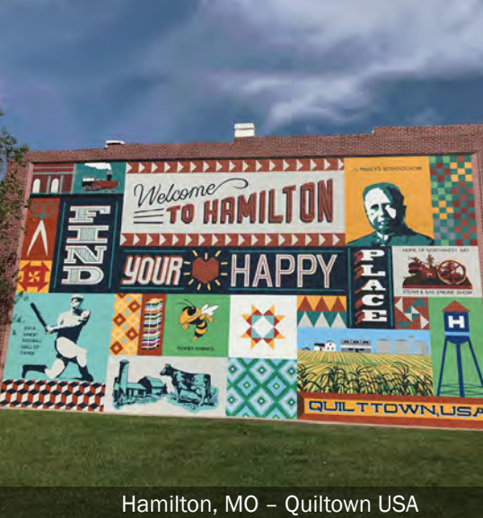
Hamilton, MO – Quiltown USA