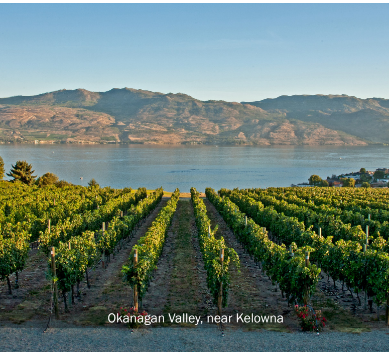
Okanagan Valley, near Kelowna

To book, visit your professional travel agent: