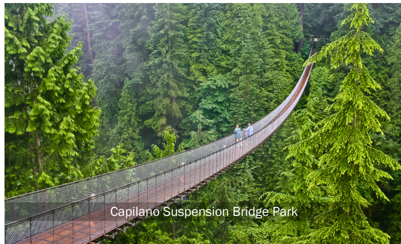
Capilano Suspension Bridge Park

On the way to Whistler, take in the amazing Capilano Suspension Bridge Park . The original bridge was built over 130 years ago. With a guided tour explaining the rich history of this park, soak up the beautiful scenery and of course, venture across the famous bridge. This afternoon stop in Squamish to board the Sea to Sky Gondola . It's a 10 minute ascent in an enclosed gondola, offering sweeping views of Howe Sound, the majestic coastal forest and surrounding mountains. At the top, there are two different interpretative trails to enjoy with cantilevered viewing platforms, and the Sky Pilot Suspension Bridge.